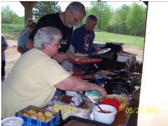
Going through the chow line