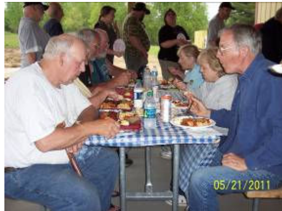
Eating all the fabulous food