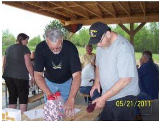
Guesses are made