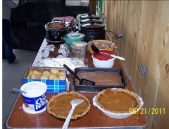
A table of YUMMY food!