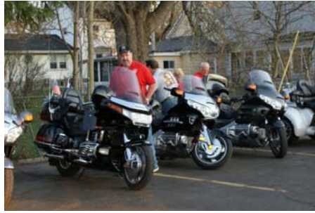
Alpha Coney Island